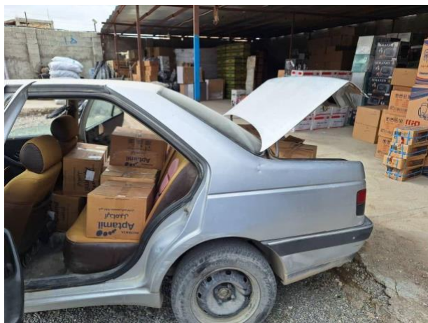
Figure 1. Procuring bulk milk powder through our reliable local contacts.

A total of 660 cans of powdered milk, valued at $2,500 (520,461,000 Rials), were procured and distributed in three stages (please refer to the Appendix for a copy of the receipt). Each baby was given three cans of powdered milk. The distribution process was facilitated through trusted local connections, ensuring efficient and transparent allocation.