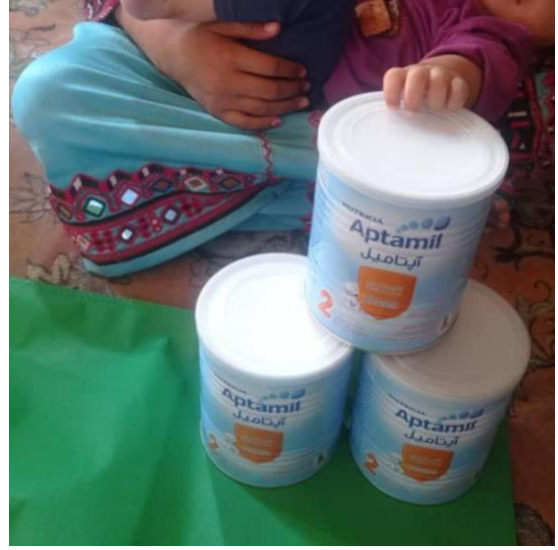
Figure 2. Distribution of milk powder to families in need.