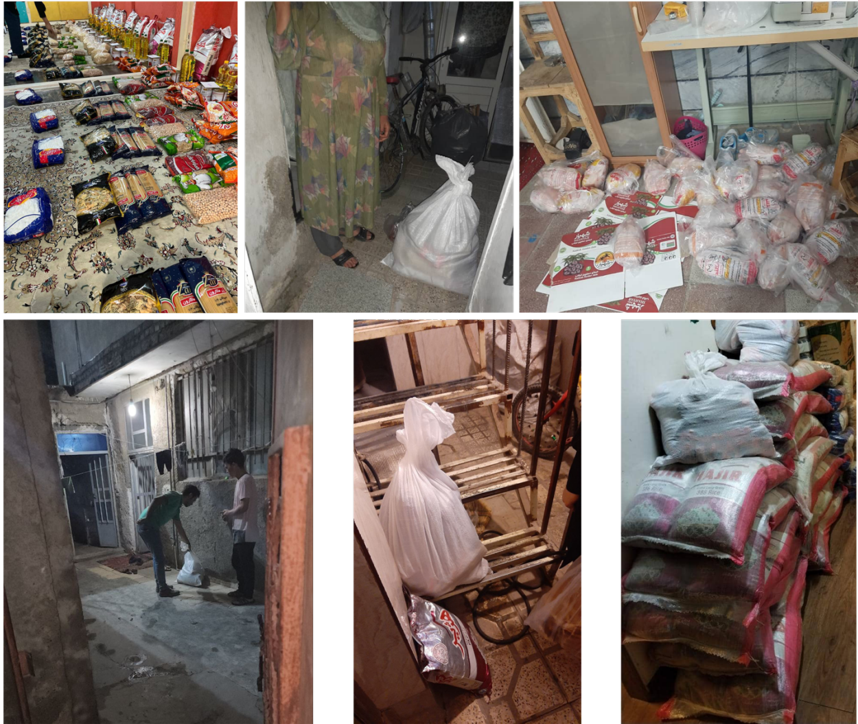
Figure 2. Photographs of the food basket distribution in Pakdasht, Tehran province, Spring 2023.

The additional funds raised in this campaign have been effectively utilized to provide nourishing meals for 150 families in need within the Pakdasht region of the Tehran province including including Qohe, Jito, Turkabad, Shen-mase, Sepah Square, and Froonabad.