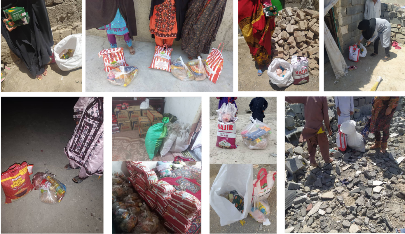
Figure 1. Photographs of the food campaign in Sistan-Baluchestan province, spring 2023.

This campaign not only provided nourishment but also instilled hope and resilience within the communities we served. As we reflect on the accomplishments of this initiative, we remain steadfast in our commitment to creating lasting positive change in the lives of those who need it the most.